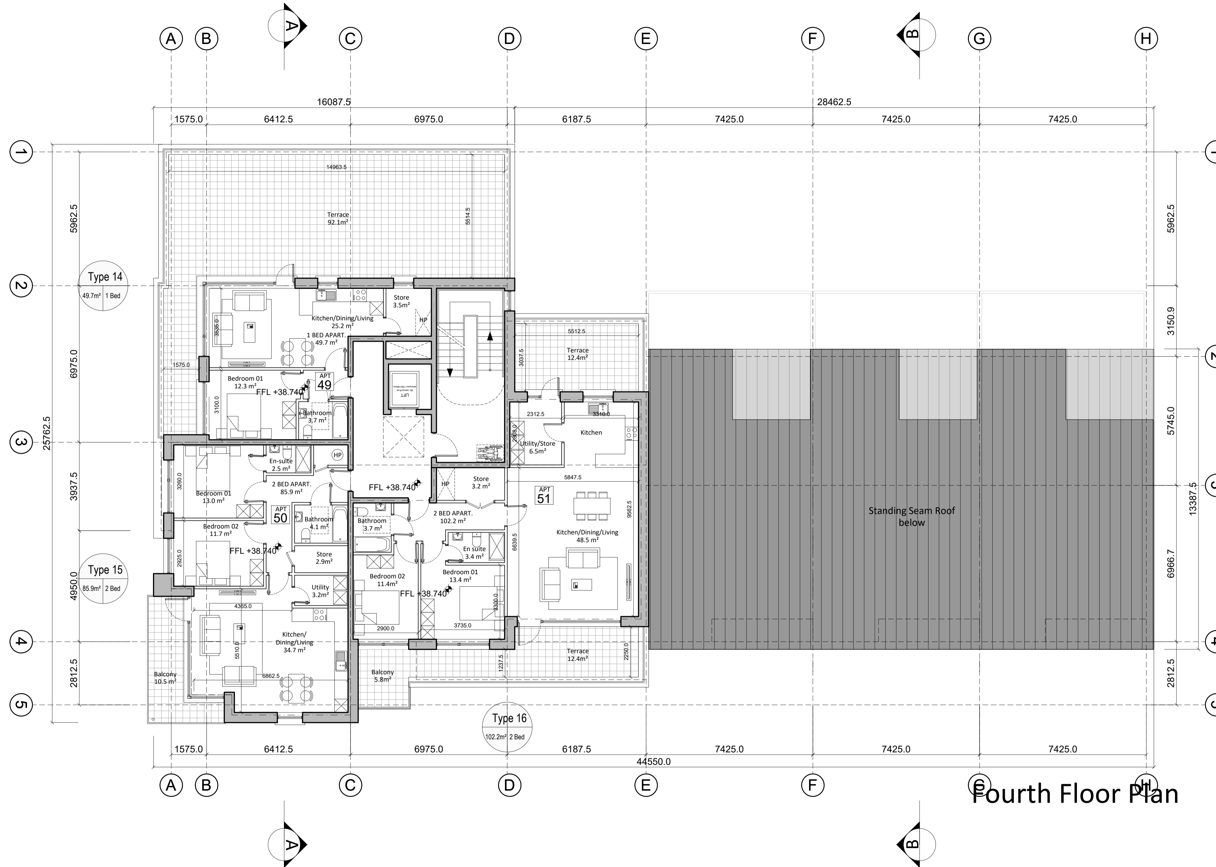
Fourth Floor Plan

NOTE: Do not scale from this drawing, written dimensions only to be used. This drawing is for planning purposes only & not for construction. Levels shown are for information purposes only & may not relate to O.S. Malin Head Datum. For actual O.S. Malin Head Datum always refer to the Site Layout Plan. DDA Architects Ltd. retain copyright and ownership of this design which is not transferable.